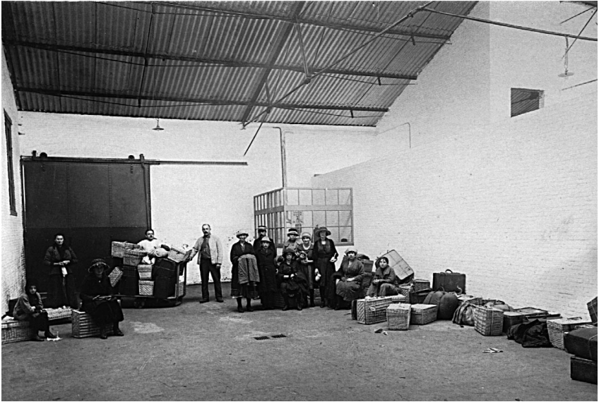
The baggage room