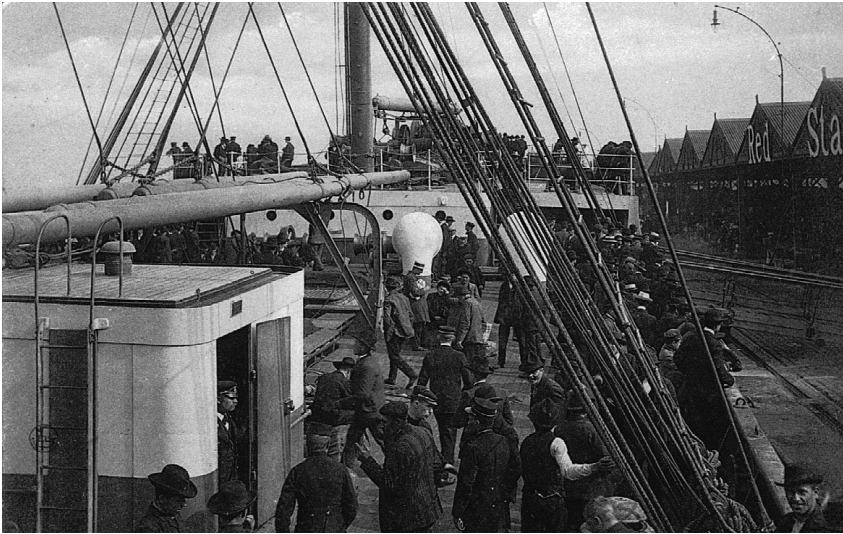
View on board a steamship of the Red Star Line

Another source are the files of applications for American nationality: the Naturalisation Files. In the 19 th century however these dossiers provided little information regarding arrival details. Persons had to live at least five years in the United States before they were eligible to submit an application. These archives differ from states to state. The various regional archive services should be contacted for further information.