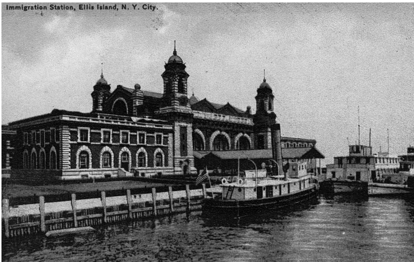
View of the Immigration office at Ellis Island, New York (USA)